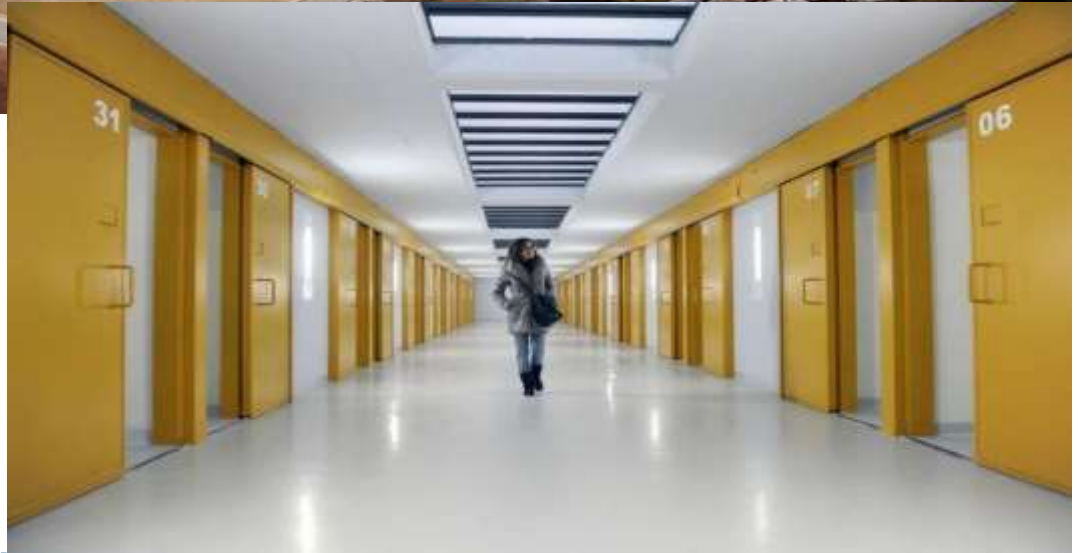
IOWA. TURNHOUT MEETING 2018