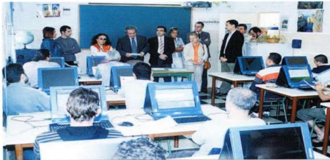
Una representación del MEPSYD y el equipo de Dirección del Centro Penitenciario de Los Rosales, durante el acto de inauguración de ayer.